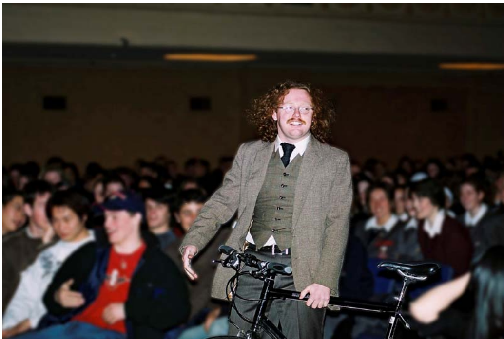
Albert Einstein seen in Melbourne